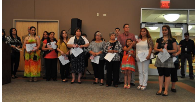
2014 Elgin new citizens with certificates

If your learner has become a U.S. Citizen in the past year, please notify the office and plan to attend the ceremony.